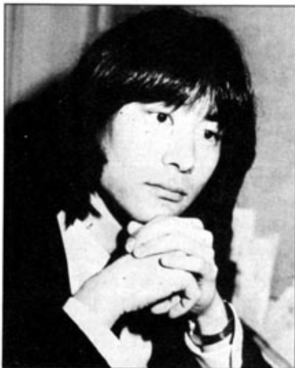
KENT NAGANO Conductor

longing to his father. After earning a small amount of money by writing music for a cowboy movie, he bought his first recording studio in 1962. He founded his first independent record label in 1969 ( Bizarre ), followed by several others ( Discreet , Zappa & Barking Pumpkin ). He has been married twice. His second wife, Gail, has successfully tolerated him since 1966. The Zappa's have four children: Moon (16), Dweezil (14), Ahmet (9), and Diva (4).