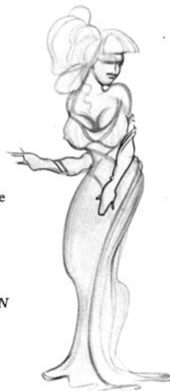
A Gossamer Twin from Mo 'n Herb's Vacation