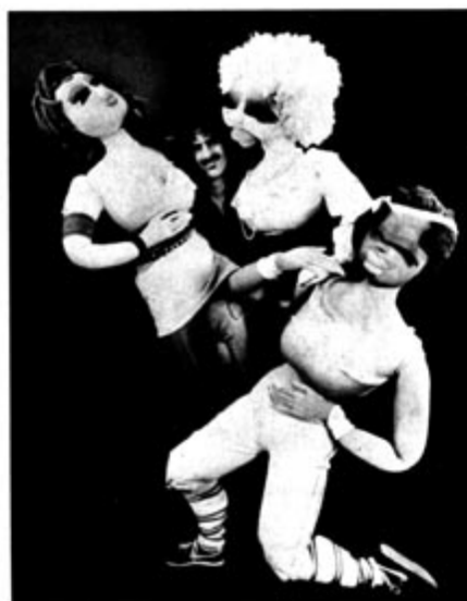
Frank Zappa and Puppets

The foot doctor says you might need an operation.