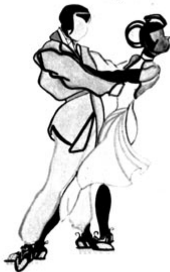
The Chic Set from Sinister Footwear

Illegal Aliens Society's Professionals Children Beautiful People The Chic Set Inanimate Objects